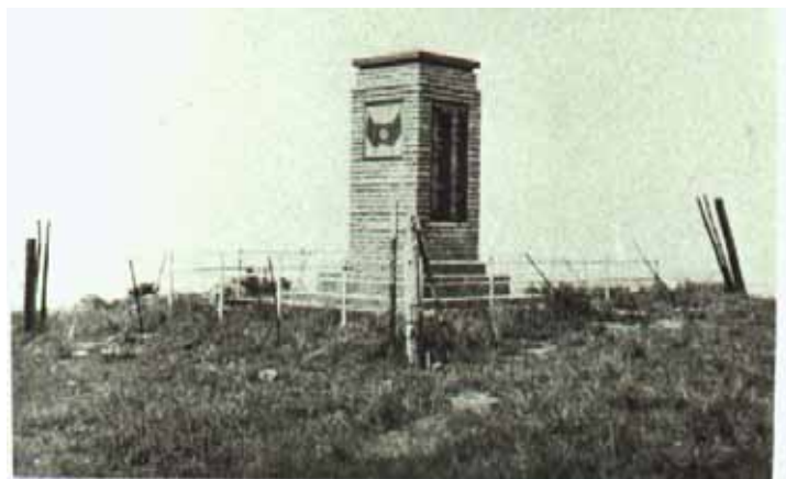
Monument erected to the Boer soldiers who were killed Or died of wounds during the Battle of Spioenkop

Apart from the Pretoria men there were many other dead and wounded, mostly Carolina burghers from the Eastern Transvaal.